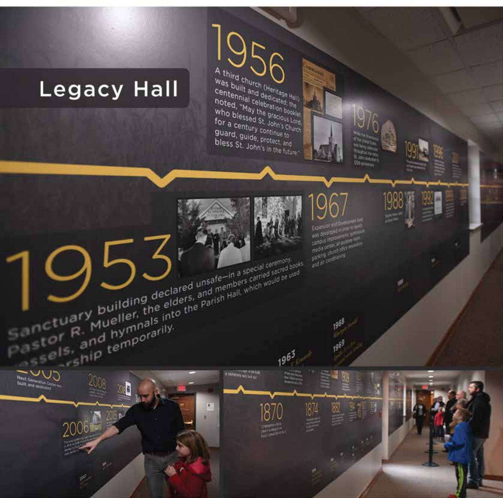
Sampling of Legacy Hall timeline

The journey began 168 years ago! Stop by the Sanctuary's east hallway and explore our church's storied history, discover the events that forged our future, and meet the trailblazers who led the way.