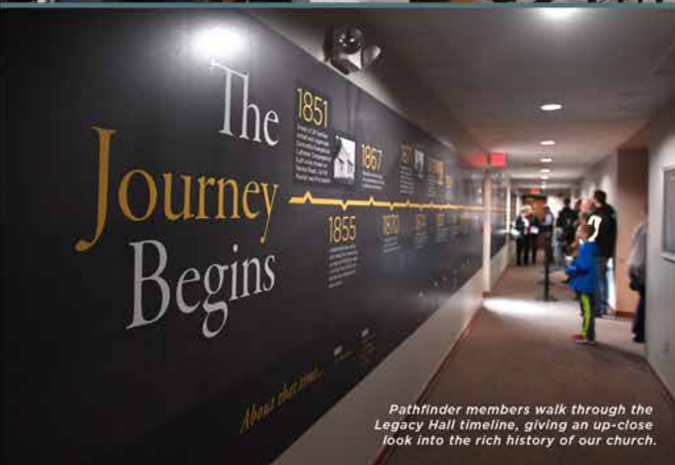
Pathfinder members walk through the Legacy Hall timeline, giving an up-close look into the rich history of our church.