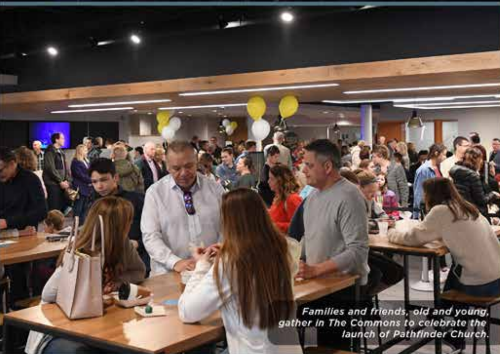
Families and friends, old and young, gather in The Commons to celebrate the launch of Pathfinder Church.